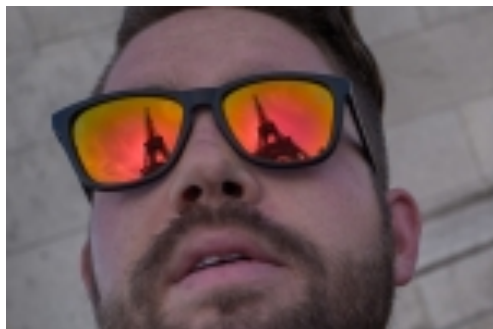
La Tour Eiffel