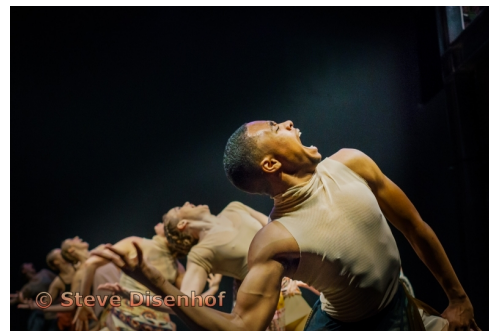
The Passion of Dance